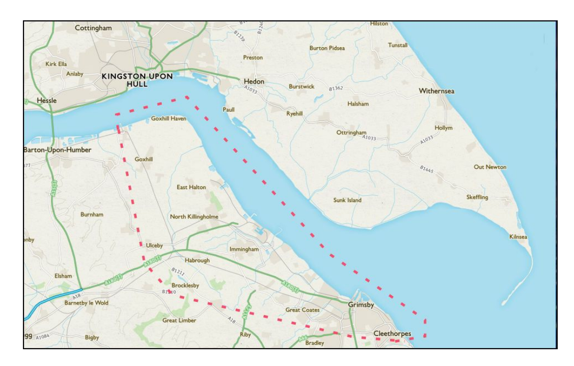
Fig 2 Topographical map of the CNNL

A mind map of the CNNL is being developed at: https://www.mindmeister.com/802521356/oats-peas-beans-and-barley-grow