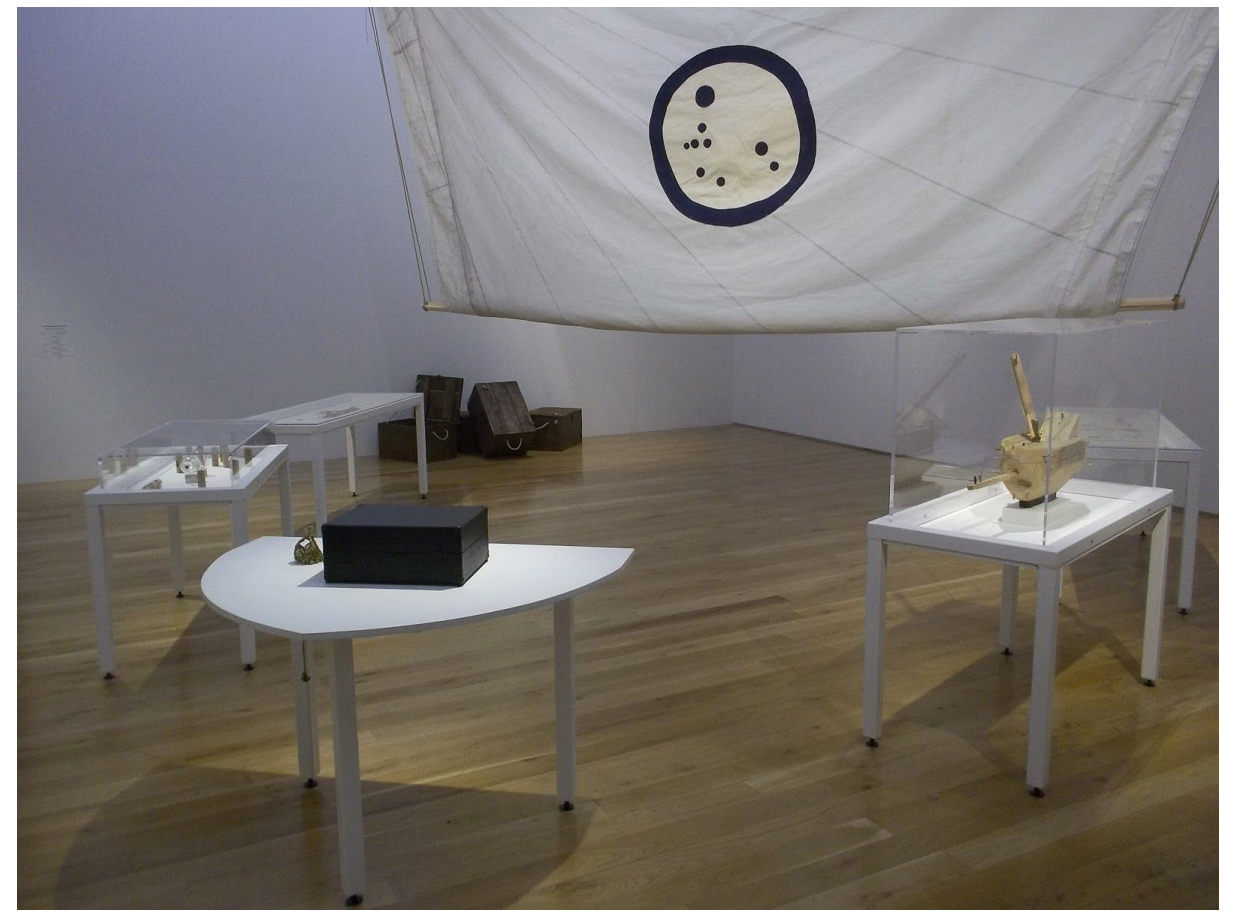
Fig 1 Seed Journey: Artes Mundi 7 (2016)

Each artist brought their own unique perspective to present stories that explore what it means to be human in contemporary society (Fig 1). Whether introspective and deeply personal or engaged with broader social and cultural issues, each artist demonstrated the importance of art and culture in our everyday lives. Their stories challenged our preconceptions of the meanings of culture and ecology, to open up new ways of engaging with the future survival of a globalised society with seriously failing ecosystem services.