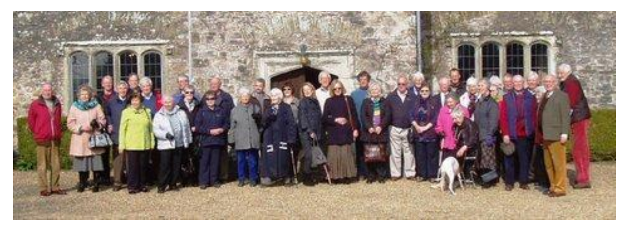
Society members outside Llansannor Court

It was a glorious spring day and we all enjoyed seeing the buildings and hearing of their history as well as the generous hospitality of our hosts and we were able to donate £150.00 towards the maintenance of the fabric of the Church.