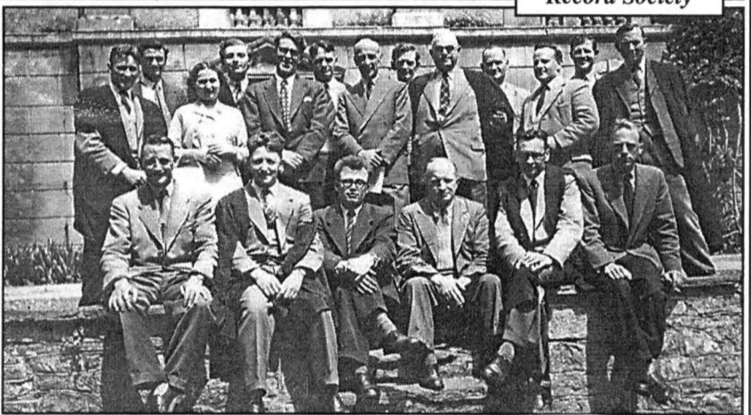
ABOVE: Most of the Cowbridge staff, - pictured in the garden front of Old Hall in summer term of 1955.