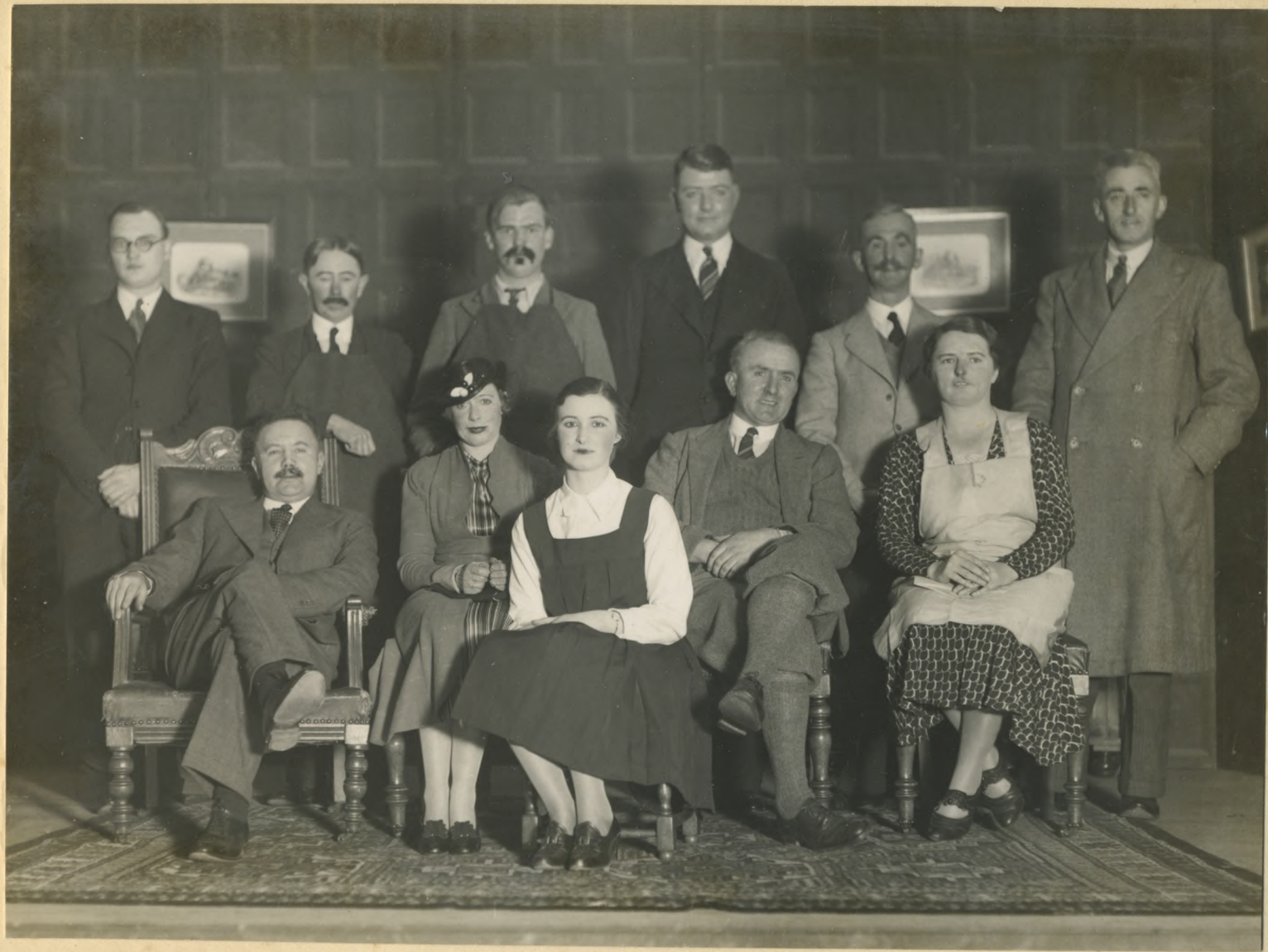
"PAYMENT DEFERRED" MARCH 15TH & 16TH, 1937.