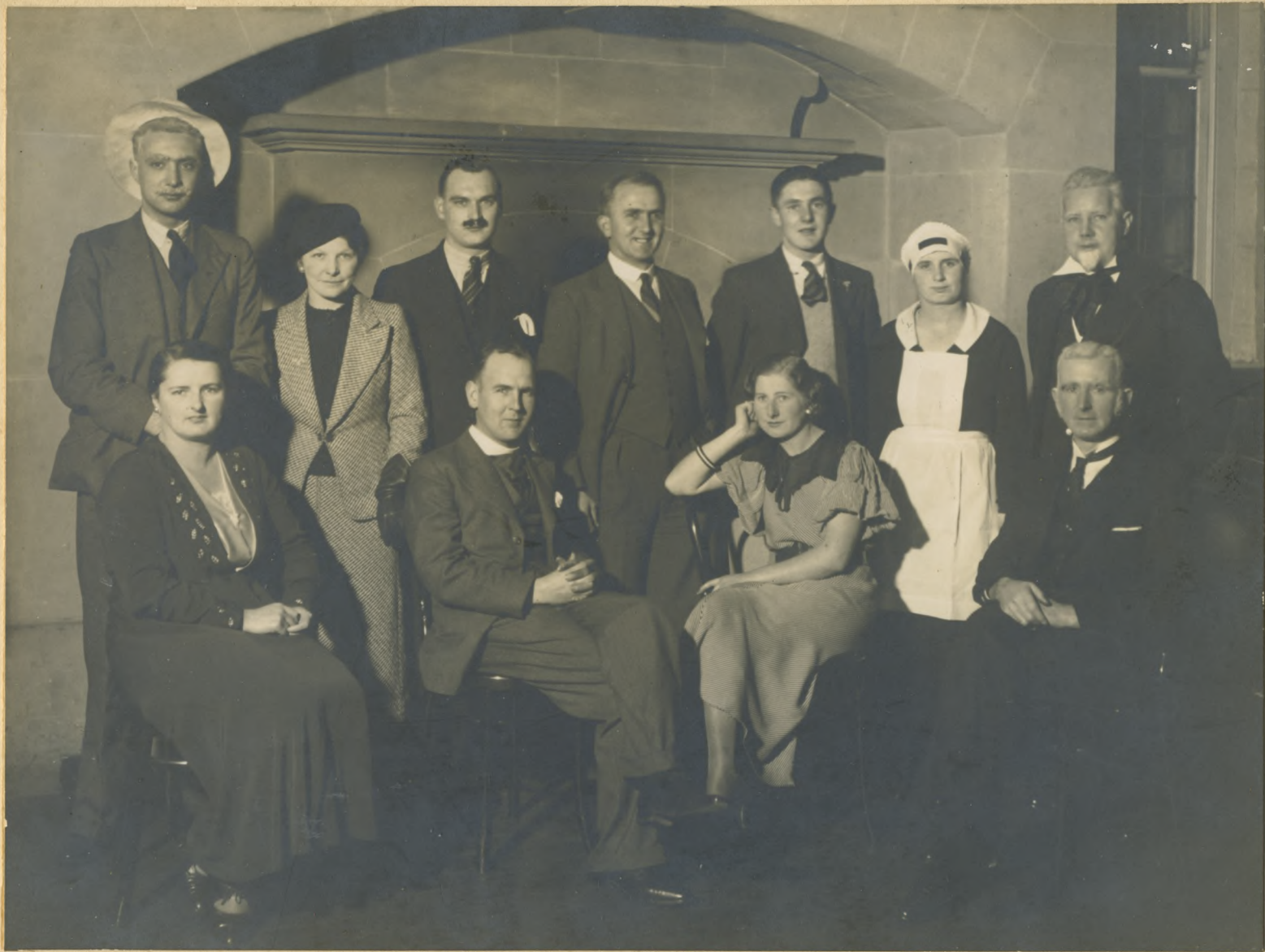
" THE COMING OF SIMON EVAL" NOV. 19TH & 20TH, 1935.