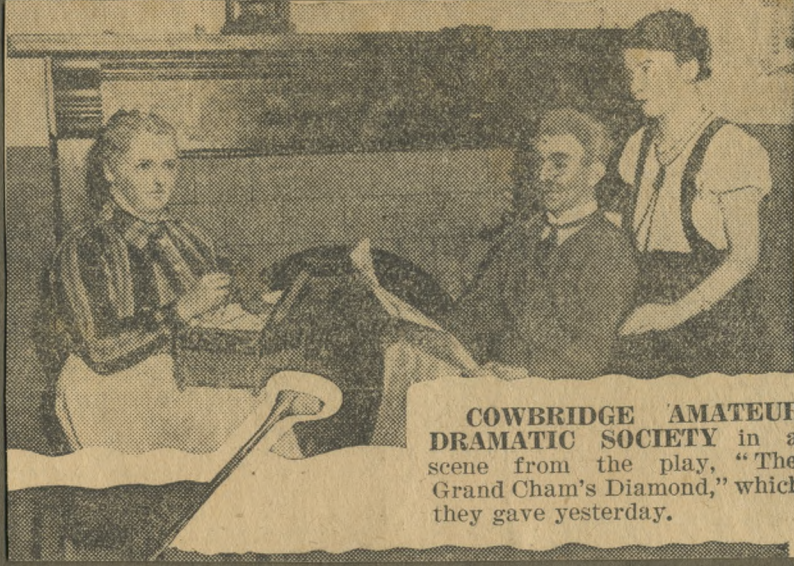
COWBRIDGE AMATEUR DRAMATIC SOCIETY in a scene from the play, "The Grand Cham's Diamond," which they gave yesterday.

There was a big audience, which was not lacking in its appreciation of dramatic entertainment of unusual merit.