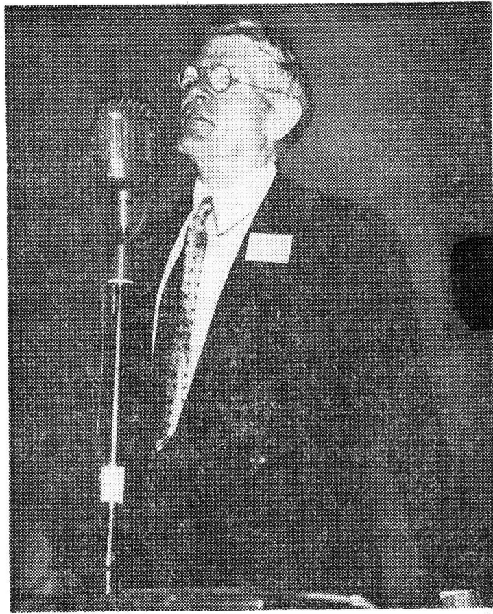
national group yesterday. At right: Arthur H. James of Plymouth, Pa., former governor of that state, presides at song session. Story and other picture on Page 1B.