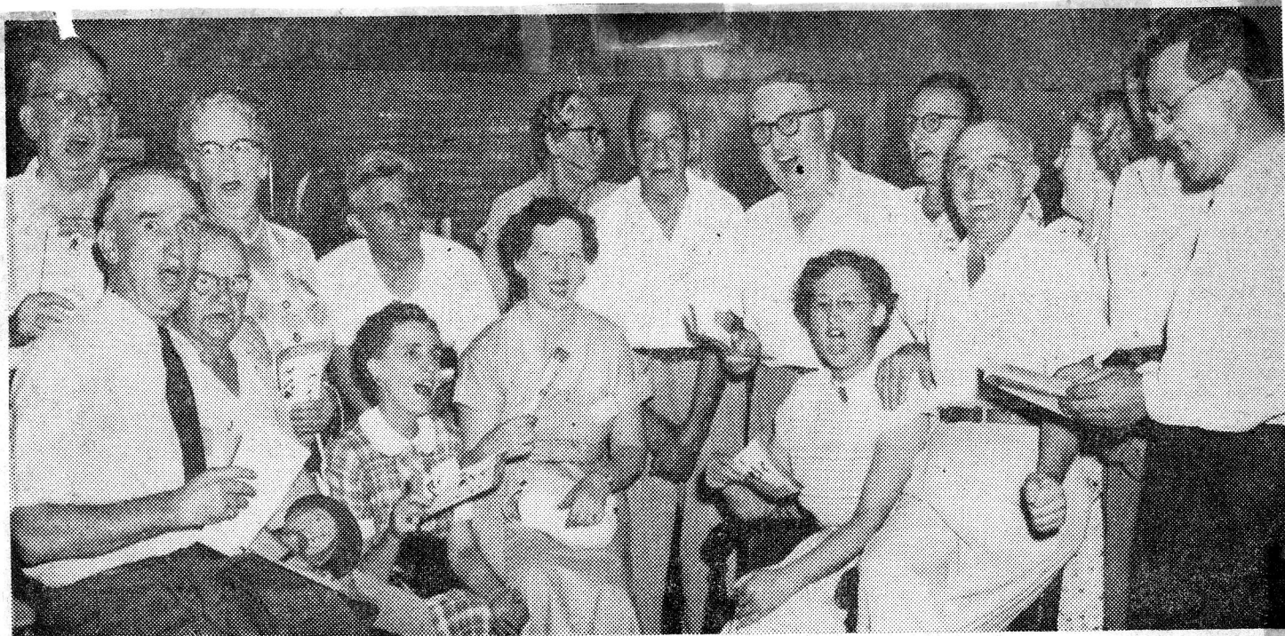
GOOD NEWS —The Gymanfa Ganu is under way. Among the 5,000 Welshmen in town for the 22d national festival of song are these joyous songsters caught by the photographer as they raised their voices in lobby of Powers.